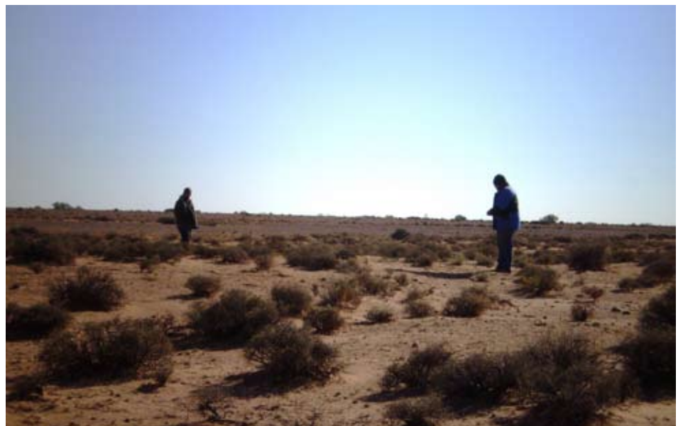
Figure 1 Heritage Survey at Marree.

The company is pleased to announce that initial drill testing of palaeodrainage targets at the Marree Project will commence this coming Monday 16th July 2007. This initial drill program will comprise of approximately fifty (50) rotary mud holes and has been designed to test multiple palaeodrainage locations identified from the extensive airborne electromagnetic survey (AEM) completed by Eromanga in December 2006. The Company's primary focus at Marree is for sandstone-hosted (roll-front) style uranium mineralisation within buried ancient river systems (palaeodrainages) similar to known deposits at Beverley, Beverley 4 Mile and Honeymoon. All holes will be geologically and geophysically logged, using Eromanga Uranium's logging truck, and samples submitted for uranium analysis as appropriate. Based on previous experience the initial drill program will take a minimum of 4 weeks to complete.