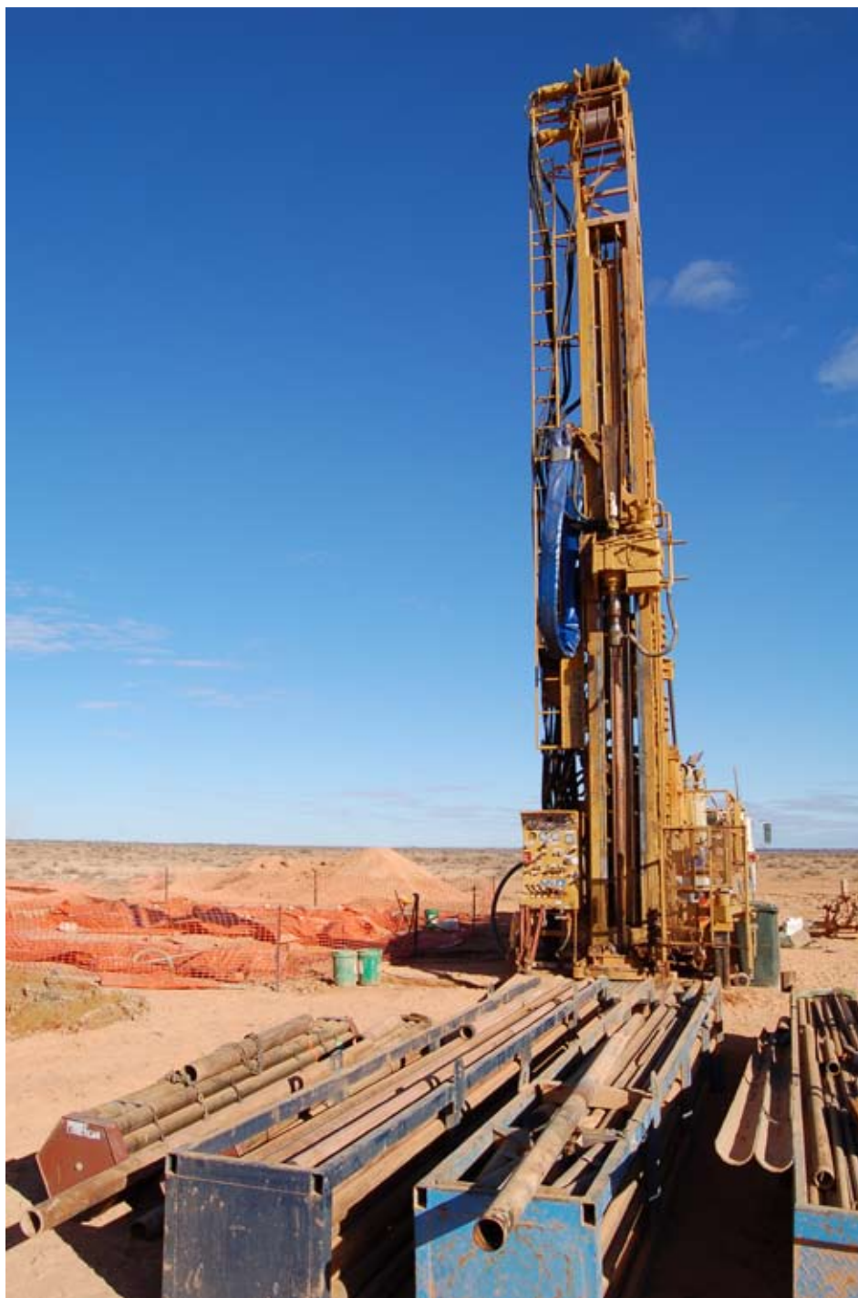
Figure 2 Drillrig at Billa Kalina.

Based upon recent analysis of the geology of the Abminga area the Company has applied for two additional exploration licences adjacent to our current landholding (Figure 4). These applications cover favourable stratigraphy at relatively shallow depths and will consolidate Eromanga's exploration position at Abminga. These new applications will be held 100% by Eromanga Uranium Ltd and will not form part of the Eromanga Basin Joint Venture with Maximus Resources Ltd.