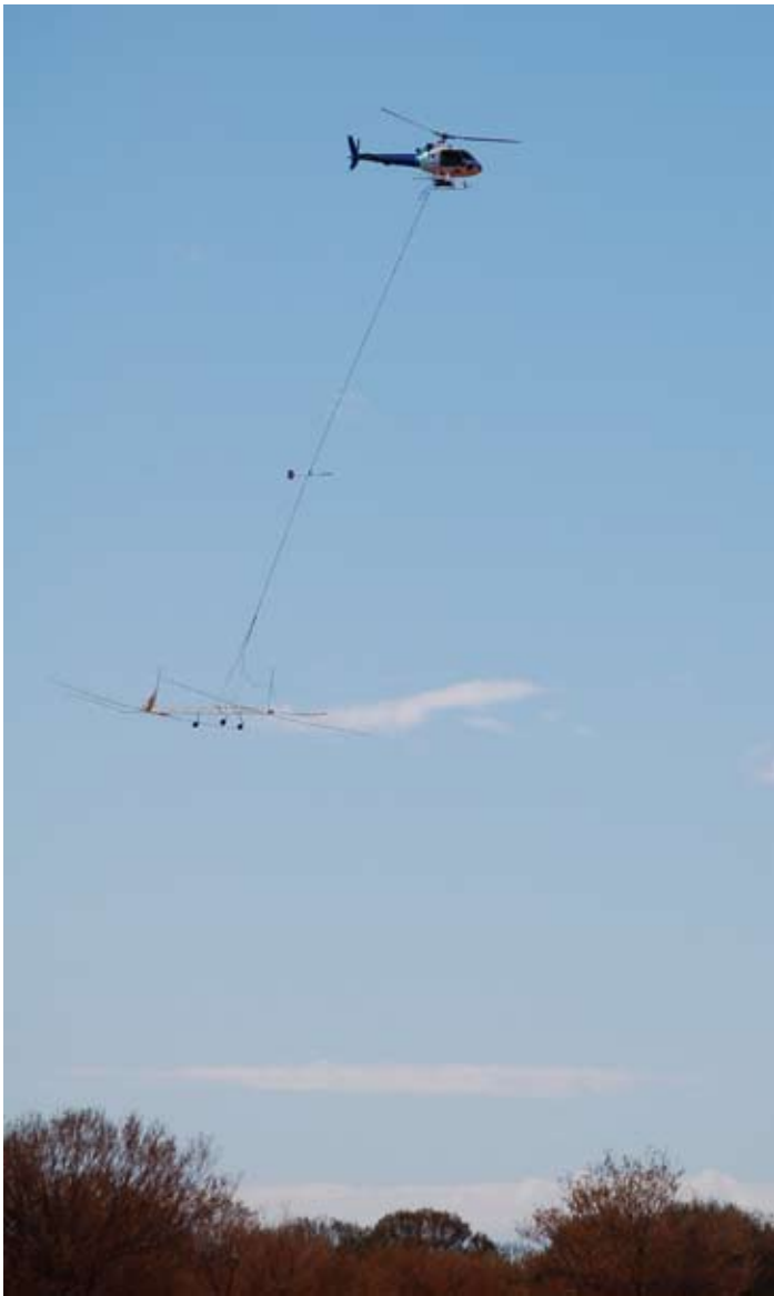
Figure 3 Airborne EM survey at Abminga.

It is intended that, following a field-break, the survey crew will mobilise to the Billa Kalina Project on, or about 1st August 2007 to undertake approximately 4000 line/km of AEM covering Eromanga's entire tenement position at Billa Kalina.