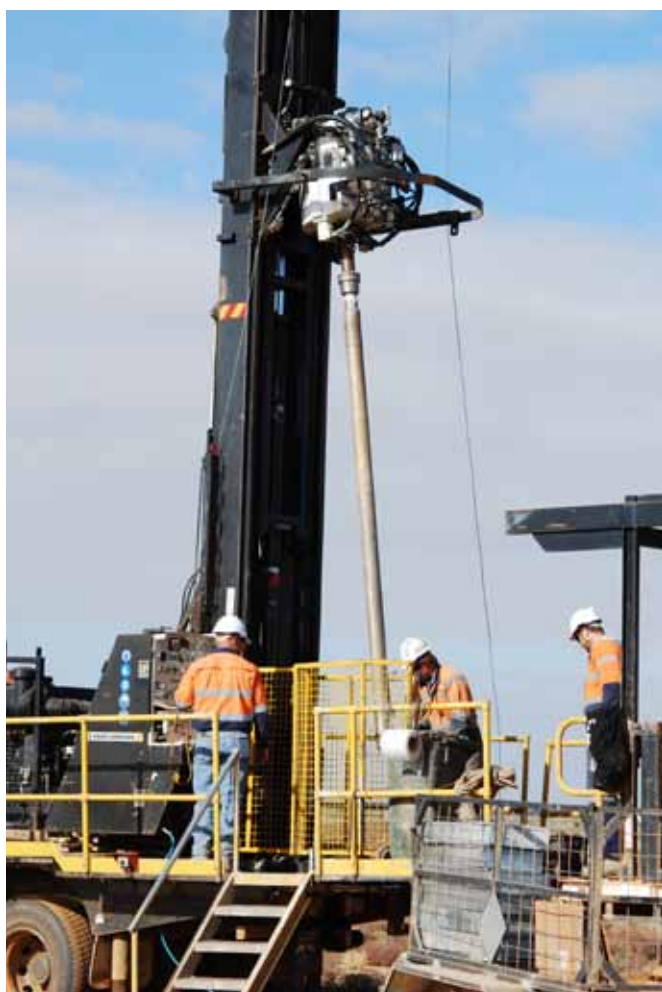
Sonic drilling at the Wertaloona Project, May 2011.

Based on ERO's own evaluation these untested parts of the sedimentary succession also have good potential for lithium and uranium.