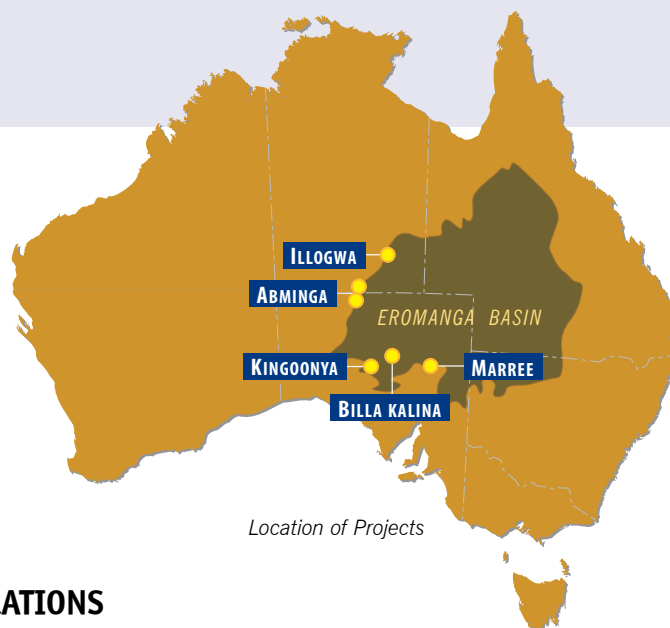
Location of Projects

Eromanga Uranium Limited ACN 119 031 864